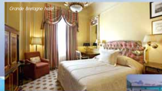
Grande Bretagne hotel

* Rates per person in Euro, breakfast included