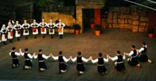
Dora Stratou Theater