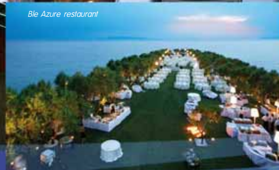
Ble Azure restaurant