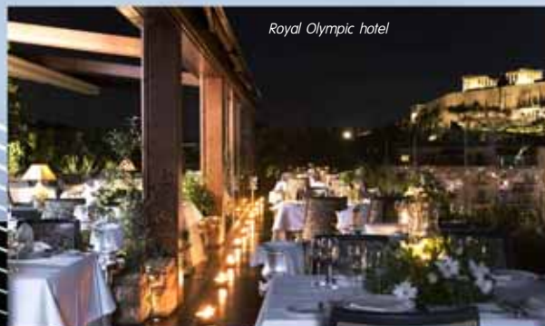
Royal Olympic hotel